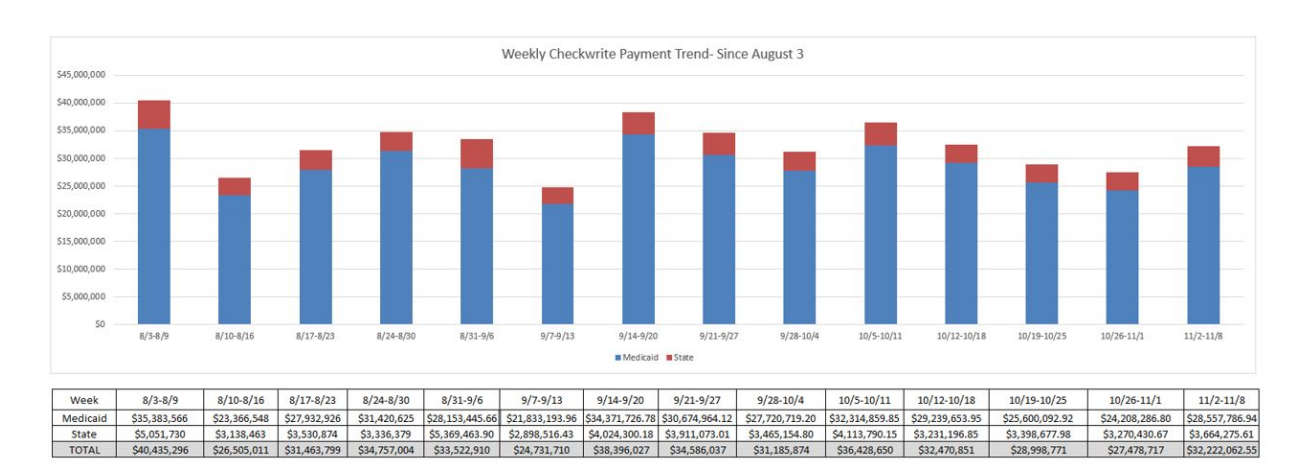
Figure 1: Weekly Payment Trend, as of November 13, 2020

Weekly estimated payments went to all behavioral health providers from January 23, 2020 through August 3, 2020. These payments were calculated for each provider based on their 2019 historical payment average. Weekly payments averaged approximately $35 million and approximately $1.06 billion total by the end of estimated payments on August 3, 2020. As of November 13, 2020, Optum has released 14 weekly payments, totaling approximately $453 million. Weekly payments are in line with average 2019 historical payments ($30 - $35 million).